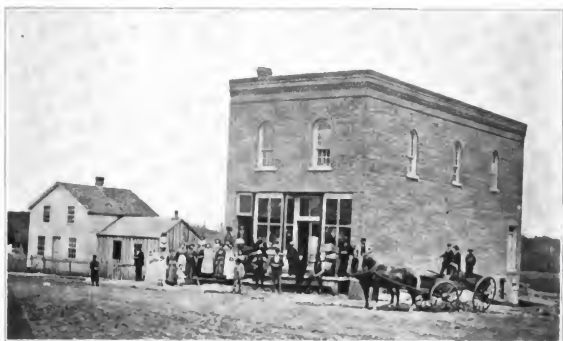
OLD FOREST CITY SCHOOL Beside Barton's store in the early '70s.